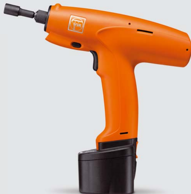
ASM 9 two-stage screwdriver

The shortest, lightest process-optimised offset screwdriver for up to 10 Nm on the market.