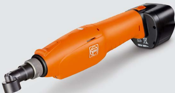
ASW 9-10 offset screwdriver

FEIN AccuTEC screwdrivers satisfy the stringent requirements placed on screw connection tolerances: irrespective of the application, tightening torques remain at the same level. The restart lock permanently monitors the battery charge. If it is no longer sufficient for the screw connection, the machine cuts out. It is not possible to continue until the battery has been replaced. The restart delay locks the machine after the screw connection has been made, avoiding excessive tightening.